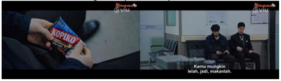
Figure 3. Kopiko Scene - Episode 12

Then in episode 12, the scene in the hospital shows two actors waiting. While waiting, one of the actors offered Kopiko candy and said, "You're probably tired, so eat it."