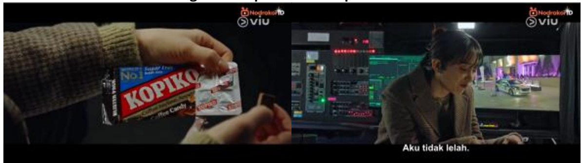
Figure 2. Kopiko Scene - Episode 11

Meanwhile, in episode 11, the scene shows the actor yawning, expressing sleepiness and asking, "Go Eun, aren't you tired?" The actress who was asked then opened the Kopiko blister and consumed it and said, "I'm not tired."