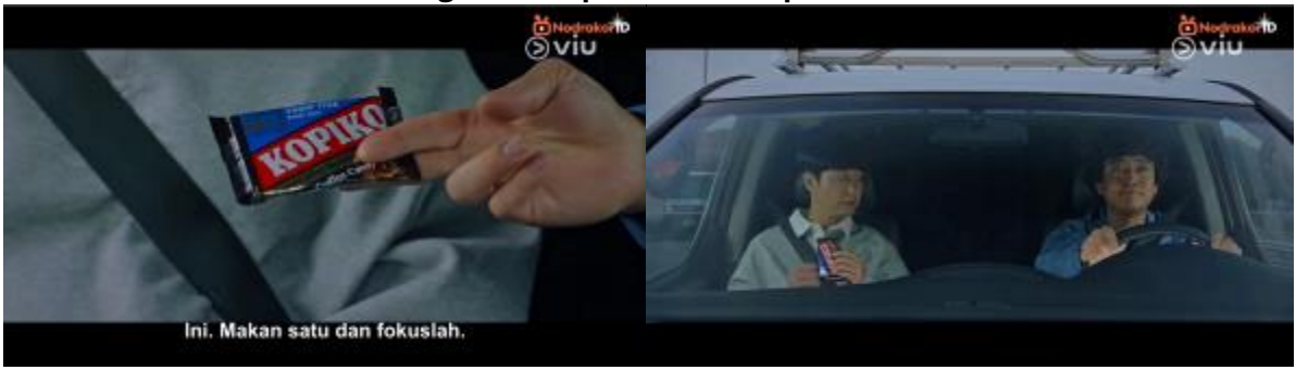
Figure 1. Kopiko Scene - Episode 7